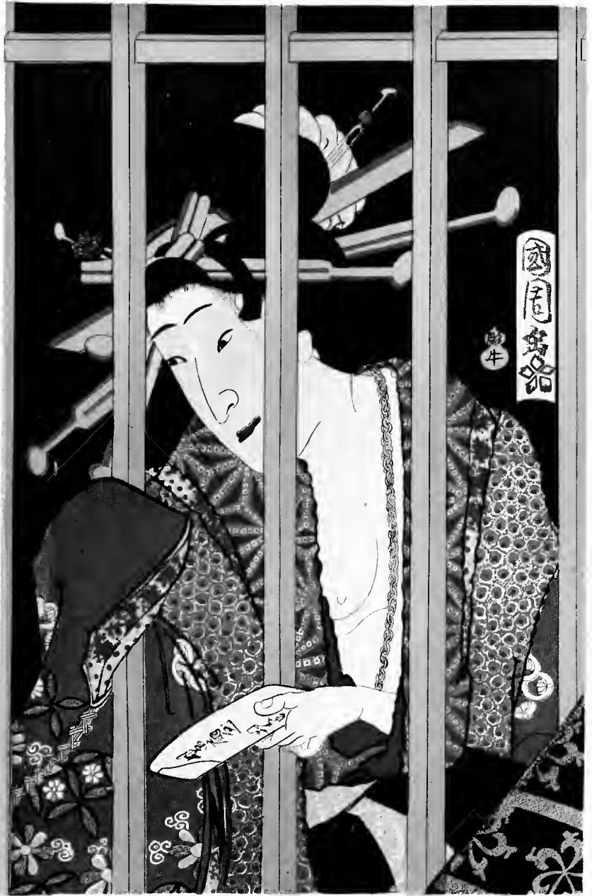
The Heroine of a Problem-play.